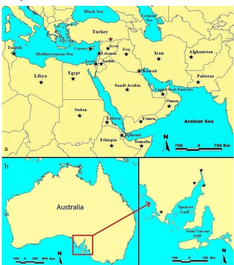
Fig. 1. The distribution map of Suaeda aegyptiaca in world with the new record, a. General distribution (Asia, Africa and Arabian Peninsula) Red star indicate the new record, b. It is naturalized in Australia.

00614671, photo!). UNITED ARAB EMIRATES: Prope Dscheddam in littore maris rubri, Schimper 1837 no. 867, (HBG506283, photo!); Ayn al Faidah area, in coastal area and Al Ais area, Salty, sandy soil, s.l. to 200 m a.s.l, December 1989, M. Jongbloed, BYU2 (BRYV-0213632, photo!). YEMEN: SE de Yithab, Wadi Najar, Hadramaout, 1000 m, 19 January 1978, T. Monod 17312, (P-00601497, photo!); Sud Yemen: Ju'aimah, NNE de Shiban, Wadi, Hadramaout, 3 January 1978, T. Monod 16905, (P-P00601498, photo!). SOMALIA: Cote française des Somalies, Cote mer Rouge, April 1956, E. Chedeville 1633 (P-P04941770, photo!). ETHIOPIA: Hararghe prov., Ogaden, Gode, narrow patch of riverine forest along the Webbe Shibeli River, 300 m a.s.l., 1 December 1969, about 6° 00′ N, 43° 30′ E, De Wilde no: 5968, (WAG-1330801, photo!). ASIA: Schanginia baccata, P-06590542, P-04989863, P-04989864, P-04989866, P-04989868, and P-04989941 photos!); Suaeda baccata, (P-04989862, P-04989865, P-04989938, P-04989939, photos!); Suaeda aegyptiaca, (P-04989936 and P-04989937, photos!).