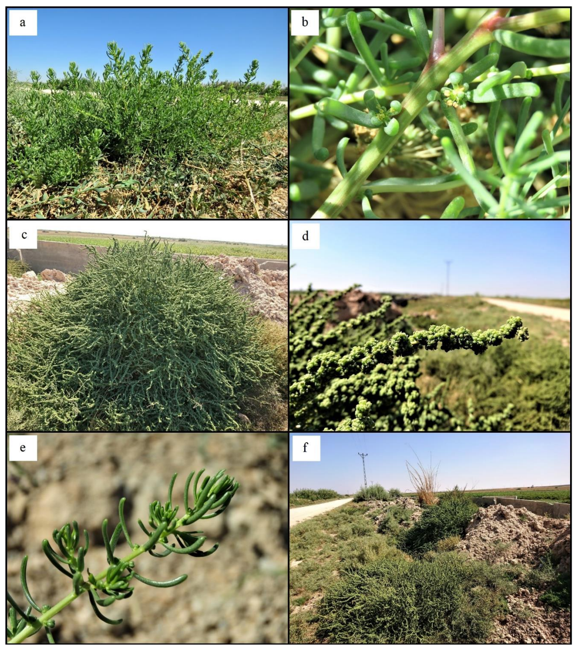
Fig. 2. Habitus, leaf, flower, and fruit structures of Suaeda aegyptiaca , a. Appearance in flowering time, b. Flower structure, c. Appearance in fruiting time, d. Infructescence, e. Leaf structure, f. Habitat.