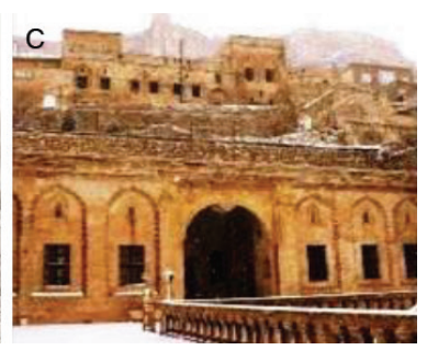
FIG 1. A-C. Early period Hospitals: Konya, the masjid of Sultan Alâeddin Darüşşifası, which was rebuilt in 1221 instead of Maristan-ı Atik which was built in 1113 at Sultan Melikşah's period (after the 2018 restoration) (a) (14); Konya, Küçük Karatay Madrasah (Kemaliye Darüşşfası [hospital]) built in 1254 opposite Büyük Karatay Madrasah (used as a museum today) established in 1251 (photo dated 1960) (b) (15); Mardin, Bimaristan section of Eminüddin Külliyesi (Islamic complex) dated 1122 which remains today in ruins (c) (16).