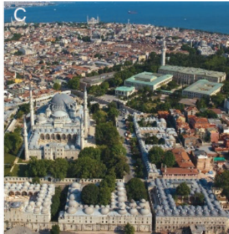
FIG. 6. A-C. Hafsa Sultan, the mother of Magnificent Süleyman. Since 2013 "Medical History Museum" (a) (43); İstanbul-Haseki, 1551. Darüşşifa in Haseki Hürrem Sultan Külliyesi (Islamic complex) (on the left side), who is Magnificent Süleyman's ex-wife (b) (44); İstanbul-Süleymaniye, 1557. The greatest Darüşşifa and Dar-üt-tibb (medical faculty with the highest degree) of the Ottoman Empire, in the Külliye (Islamic complex) of Magnificent Süleyman (c) (45).