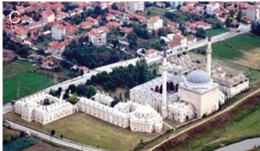
FIG. 5. A-C. XIV<sup>th</sup> century Ottoman Hospitals: Bursa, 1400. First medical school of Ottoman Empire: Bayezid's I "Dar-üt-tıbb." After the 2001 restoration, it continues to serve as "Bursa Darüşşifa Göz Merkezi" (Eye Hospital) (a) (39); İstanbul-Fatih, 1470. Darüşşifa Mescidi, which remains from Ottoman Empire's first comprehensive education and health institution in İstanbul, Fatih Külliyesi (Islamic complex). (Engraving of A.G. Paspatis dated 1877, before it collapsed) (b) (40); Edirne, 1488. Darüşşifa and Medical Madrasah from Sultan Bayezid II Külliyesi (Islamic complex). Today, "Medical Museum"-Council of Europe Museum Award (2004), in UNESCO World Heritage temporary list (2016) (c) (41).