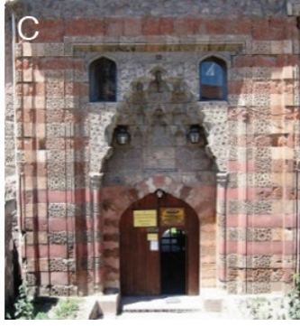
FIG. 3. A-C. Medical facilities built by Seljuk viziers: Çankırı, 1235. "Taşmescid" (Darülhadis and tomb) which remained from Atabey Cemaleddin Ferruh Darülafiyesi (hospital) (a) (31); Kastamonu, 1272. Epitaph remaining from Pervaneoğlu Ali Bey Darüşşifası (hospital) (b) (32); Tokat, 1277. Crown gate (portal) of Pervane Muineddin Süleyman's "Çifte Medrese" (c) (33).