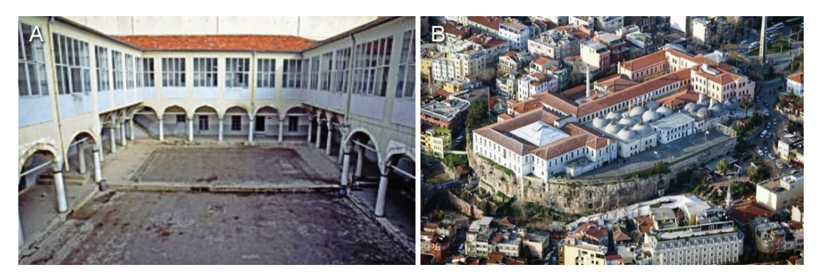
FIG. 7. A,B. The last Hospitals of the Ottoman period: İstanbul-Üsküdar, 1583. Open courtyard of the Darüşşifa of the Külliye (Islamic complex) (2010), built on the Anatolian side in the Topbaşı district on behalf of Atik Valide Sultan (Nurbanu Sultan, the mother of Murad III). Today "Fatih Sultan Mehmet Foundation University Faculty of Literature" (a) (46); İstanbul-Sultanahmet, 1621. Bath ruins (2010) from last Ottoman Darüşşifa (hospital) in Sultan Ahmet I Külliyesi (Islamic complex). It was built on the Shendone extension of the Hippodrome of Constantinople (b) (47).