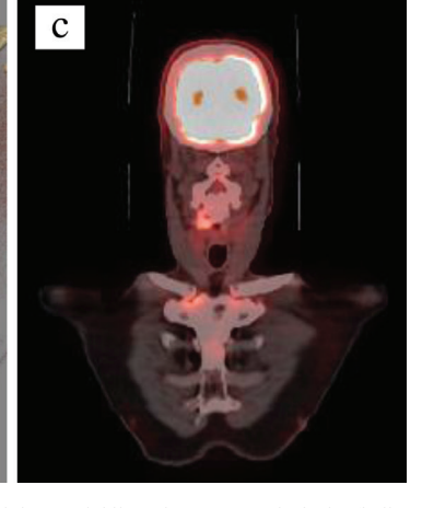
FIG. 1. a-c. Anterior view of <sup>99m</sup>Tc-methylene diphosphonate bone scintigraphy (a) showing increased osteoblastic activity in the manubriosternal, bilateral sternocostoclavicular (bull's head sign), and lower cervical vertebral regions. Computed tomographic three-dimensional reconstruction of the bones of the anterior chest wall showing hyperostosis and fusion of the first costosternal and manubriosternal joints (b) and oblique coronal <sup>18</sup>F-fluorodeoxyglucose positron emission tomography–computed tomography fusion image (c) showing increased activity in sternoclavicular joints (arthritis) and hyperostotic lesions (osteitis).

Address for Correspondence: Ufuk İlgen, Department of Rheumatology, Trakya University School of Medicine, Edirne, Turkey Phone: +90 505 446 16 83 e-mail: ufukilgen@gmail.com ORCID: orcid.org/0000-0001-6443-6426 Received: 18 September 2018 Accepted: 19 November 2018 • DOI: 10.4274/balkanmedj.galenos.2018.2018.1630 Available at www.balkanmedicaljournal.org