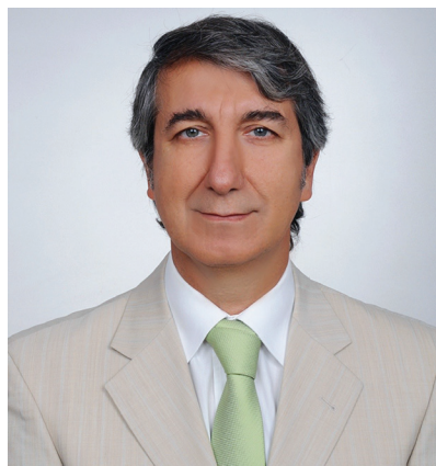
FIG. 4. Professor Erol Yalnız was the Editor-in-Chief between 2002 and 2005. In 2003, the journal was indexed in an international database (Index Copernicus) for the first time.

In 2002, Professor Yalnız was appointed as a new Editor-in-Chief of the journal (Figure 4). Only a year later, he announced that Index Copernicus was the first international database where the journal was indexed. Despite this great news of those years, the primary source of submission was still Trakya University School of Medicine in Edirne (Table 1).