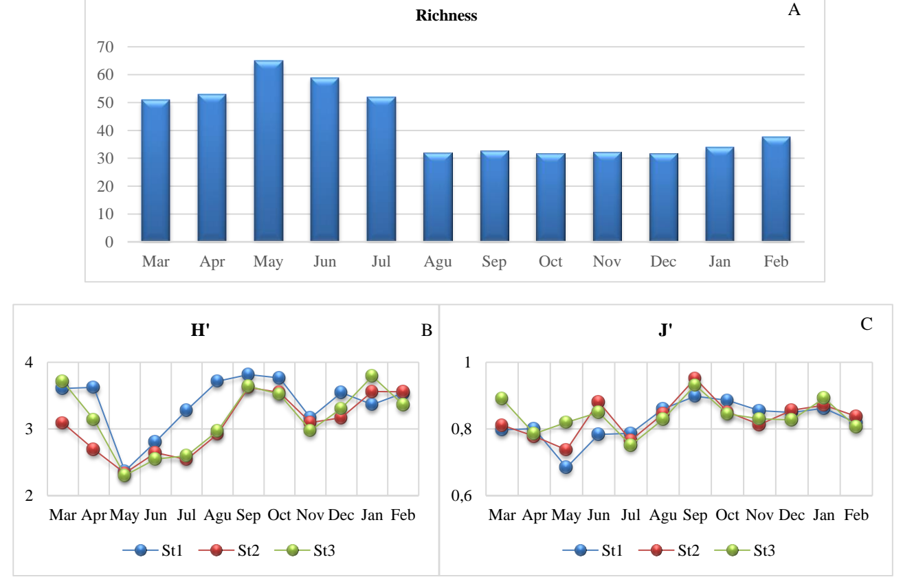
Fig. 2. Graphical representation of A) species richness and B) diversity and C) evenness indexes. The sampling months were given as abbreviations.