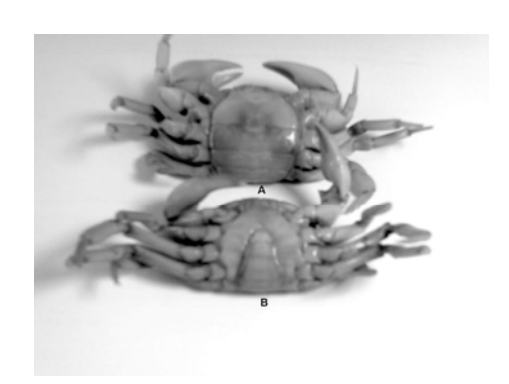
Figure 2. Potamon fluviatile (Herbst, 1785) (A female, B male, original).