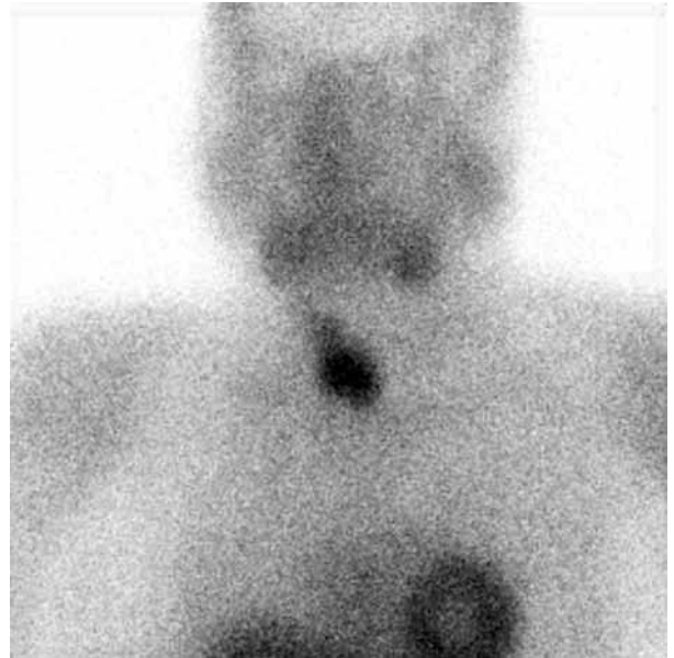
Fig. 2. Delayed scintigraphy images demonstrate washout of Tc-99m sestamibi from the thyroid gland with retention of tracer in the presumed right inferior parathyroid adenoma.

aches and multiple joints pain in her history. The histopathological examination revealed suspected malignancy of parathyroid tissue in initial surgery. She had an uneventful postoperative course with medication of hypocalcaemia. The patient admitted to our clinic with bone aches, joint pains and a mass on the right side of the neck. On clinical examination a mass was palpable in the right half of the thyroid gland. Routine laboratory investigations were with hemoglobin of 9.6 g/dl (12.2-17.2), white blood cells of 7600/l (4600-10200), blood urea nitrogen of 46 mg/dl (10-50), creatinine of 1.1 mg/ dl (0.6-1.4), glucose of 88 mg/dl (70-110), calcium 11.9 mg/dl (8.6-10.3), phosphorous 2.5 mg/dl (2.7-4.5), albumin 4.1 g/dl (3.5-5.2), parathyroid hormone (PTH) 2710 ng/ml (12-65). The immediate post injection sestamibi scan showed focal uptake in the inferior aspect of the right thyroid lobe (Fig. 1). The 4-hours delayed image