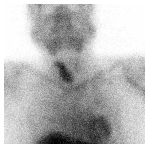
Fig. 1. Tc-99m sestamibi scan. Early images shows focal uptake in the inferior aspect of right thyroid lobe.

aches and multiple joints pain in her history. The histopathological examination revealed suspected malignancy of parathyroid tissue in initial surgery. She had an uneventful postoperative course with medication of hypocalcaemia. The patient admitted to our clinic with bone aches, joint pains and a mass on the right side of the neck. On clinical examination a mass was palpable in the right half of the thyroid gland. Routine laboratory investigations were with hemoglobin of 9.6 g/dl (12.2-17.2), white blood cells of 7600/l (4600-10200), blood urea nitrogen of 46 mg/dl (10-50), creatinine of 1.1 mg/ dl (0.6-1.4), glucose of 88 mg/dl (70-110), calcium 11.9 mg/dl (8.6-10.3), phosphorous 2.5 mg/dl (2.7-4.5), albumin 4.1 g/dl (3.5-5.2), parathyroid hormone (PTH) 2710 ng/ml (12-65). The immediate post injection sestamibi scan showed focal uptake in the inferior aspect of the right thyroid lobe (Fig. 1). The 4-hours delayed image