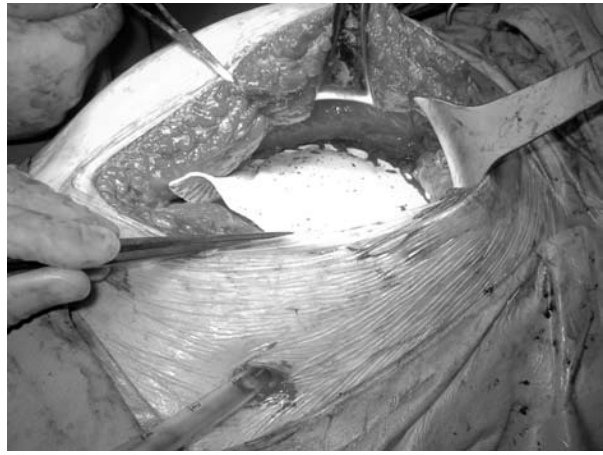
Fig. 2. Large defect reconstructed with polytetrafluoroethylene (PTFE) mesh.

Radioiodine ablation therapy was carried out in three patients, except for one medullary carcinoma patient. One synchronous papillary