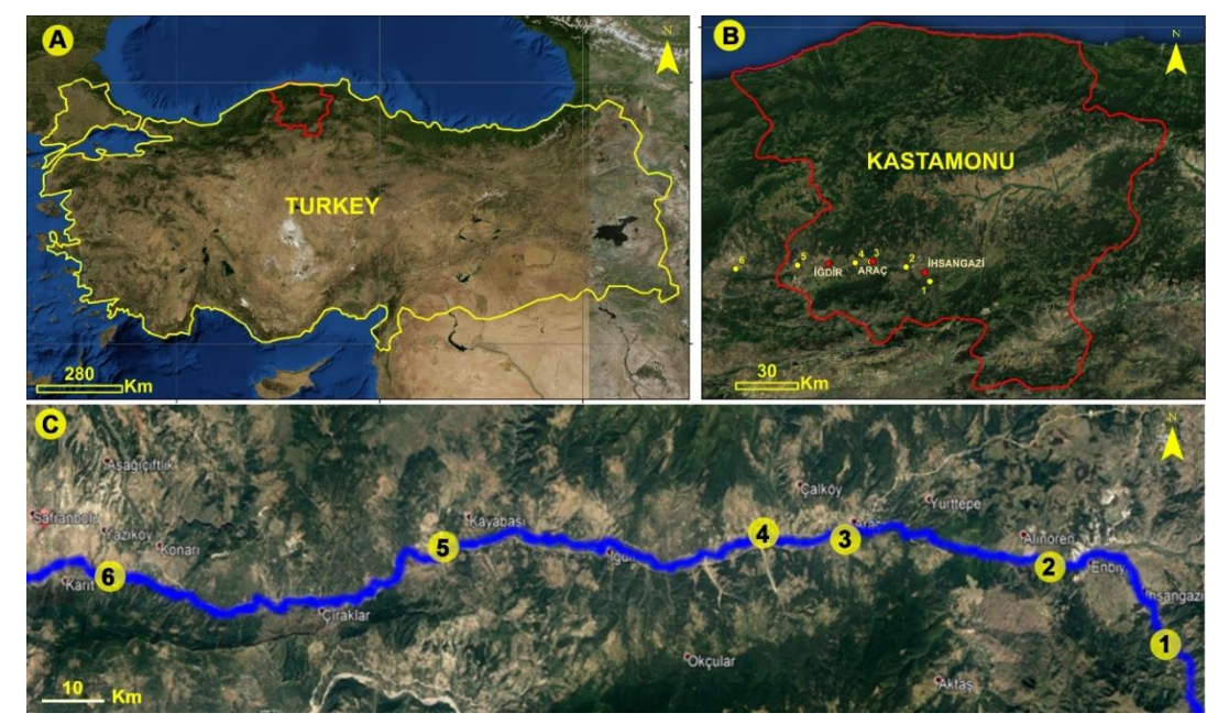
Fig. 1. (A) Map of Turkey. (B) The general view of study area. (C) Sampling stations in Araç Creek (Google Earth 2019). The numbers denote the stations whose details are given in Table 1.

affected by various human activities including city sewage systems, organic wastes, agricultural activities, hydroelectric power plants and sand quarries. Macroinvertebrate samplings were performed at 6 stations along the creek in April, August and October 2013 (Fig. 1). The coordinates and altitudes of the sampling stations as well as sampling dates and short descriptions of the localities where the stations were selected are given in Table 1.